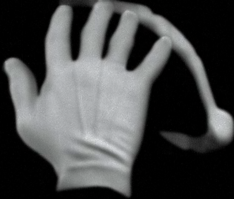
Still from Steve McQueen, "Sunshine State" (2022), HD video, sound

Marian Goodman Gallery will inaugurate its new gallery in Los Angeles with an exhibition of two works by British artist and filmmaker Steve McQueen. The show will feature "Moonlit" (2016), a sculpture of two large rocks covered in silver leaf, and the US debut of the video installation "Sunshine State" (2022).