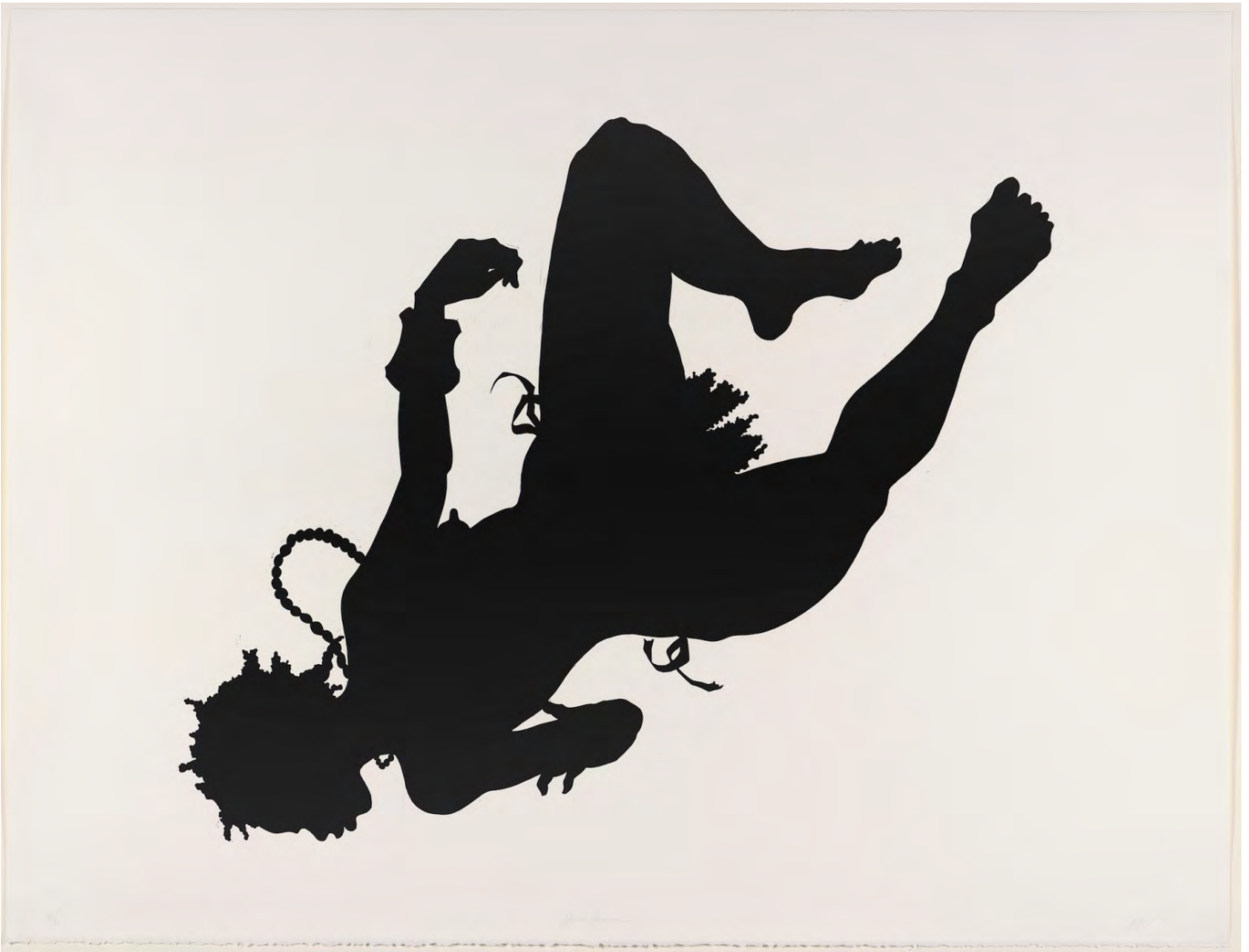
Kara Walker, "African/American" (1998), linocut, 44 x 62 inches, edition 20 of 40

For the past three decades, Kara Walker has confronted the shameful legacy of American slavery, racism, and exploitation with stark economy and intentionally disturbing frankness, laying history bare in black and white. Cut to the Quick brings together more than 80 works produced from 1994 to 2019, including paintings, prints, sculpture, film, and the cut-paper silhouettes she is best known for. This survey highlights how tragically relevant Walker's historically grounded works still are.