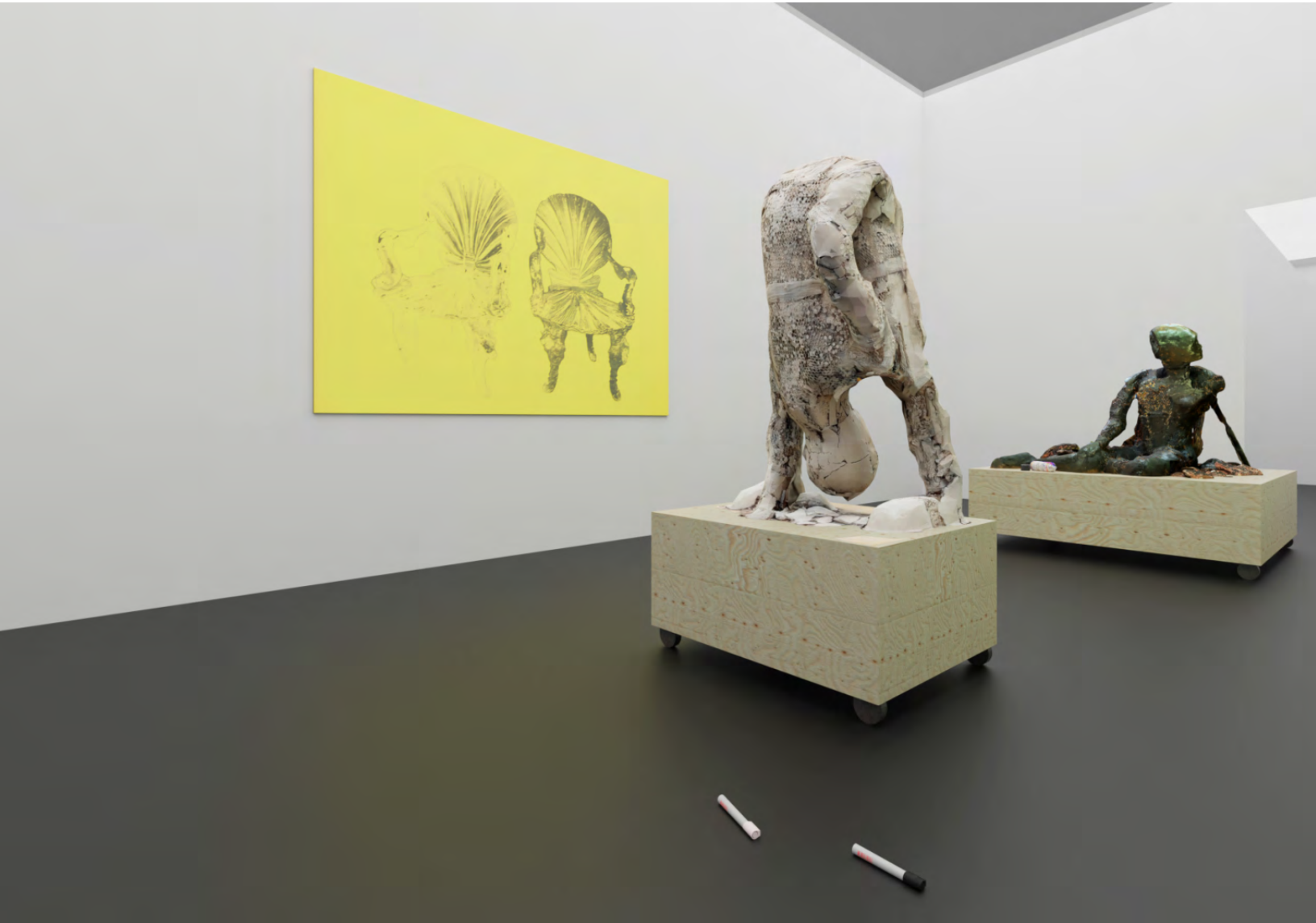
Fawn Rogers: GODOG mockup