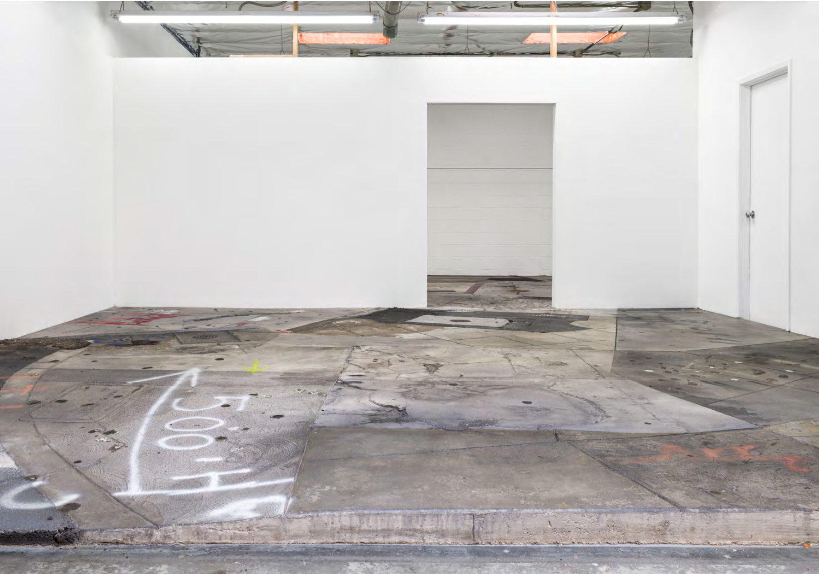
Installation view of Fiona Connor, "Continuous Sidewalk" (2021–23)

Fiona Connor's meticulously faithful facsimiles of architectural elements highlight the social functions of our built environment. In the past, the New Zealand-born artist has replicated community message boards and the doors of shuttered clubs, bittersweet reminders of lost gathering spots. For this show, Connor recreated 23 concrete sidewalk squares from downtown Los Angeles, reassembling them to form a fictional urban ramble. After an initial concrete pour, she added graffiti, gum, and other markings that accumulate over time, revealing the sidewalk as an ever-changing spatial chronicle of bodies and bustle, far from a sterile, sterile industrial expanse. Due to the weight of the work, the exhibition is held offsite at the artist's ground-floor studio in Glendale, rather than Château Shatto's 10th-floor Bendix Building location.